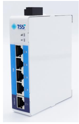
TSS cloud based router

The data can be visualized on the platform and notifications and alarms can be received on a mobile phone and via e-mail.